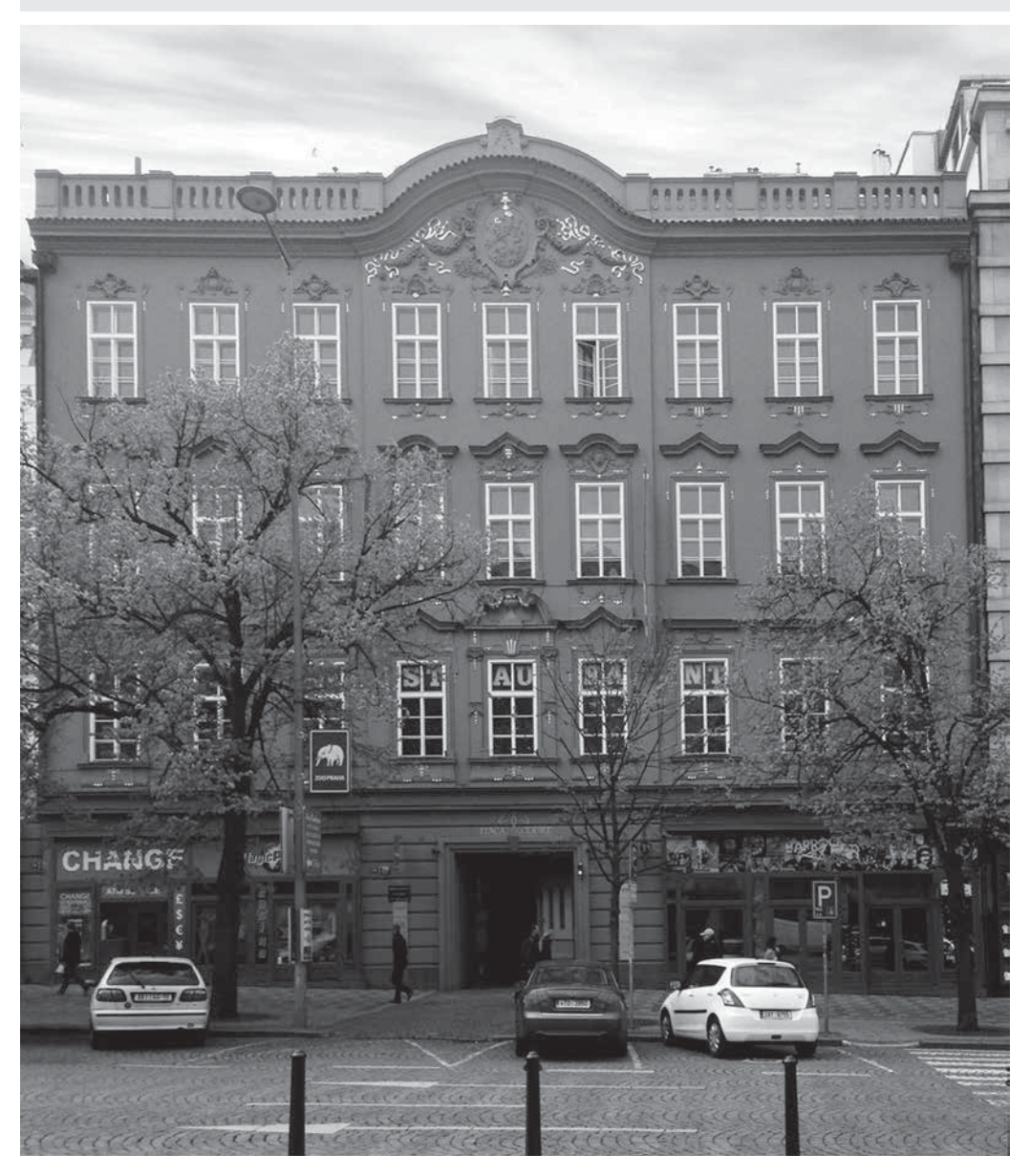
Figure 2 House No. 799/II on Wenceslas square (today's state)<sup>13</sup>

Kořistka recommended to show price development for several different products in one graph that on vertical axis is a logarithmic scale better reflecting the relatively faster rise in price of cheaper commodities (e. g. potatoes) against a relatively slower rise in price of more expensive commodities (e. g. wheat).<sup>12</sup>