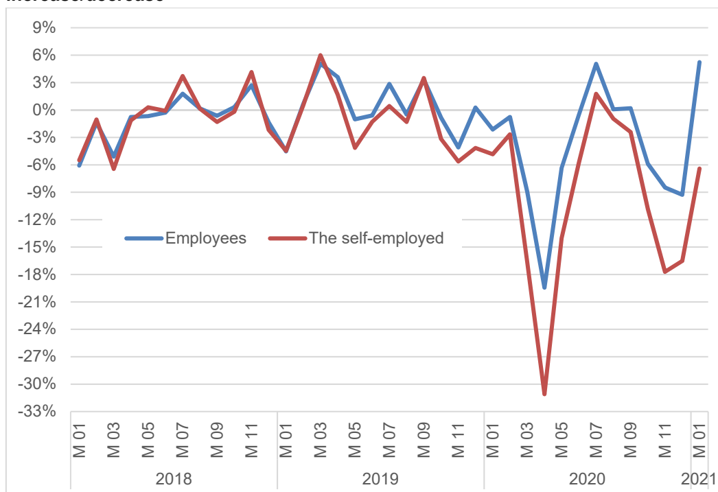
Chart 1: Weekly hours actually worked in the main job from the LFSS, year-on-year increase/decrease

Data about hours worked by individual month drawing from the Labour Force Sample Survey (LFSS), see Chart 1, are the most characteristic results describing the influence of the coronavirus crisis on the economy. They have been specially prepared since March and published within the News Release of the Czech Statistical Office (CZSO) called Rates of employment, unemployment and economic activity.