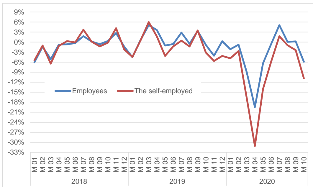
Chart 1: Weekly hours actually worked in the main job from the LFSS, index to the corresponding period of the previous year

Much deeper falls of hours worked can be found in the group of the self-employed (entrepreneurs). Their average number of hours decreased the most in April (by 31%), y-o-y. Since May, the situation started to stabilise. In June, the drop by 6% corresponded to situations