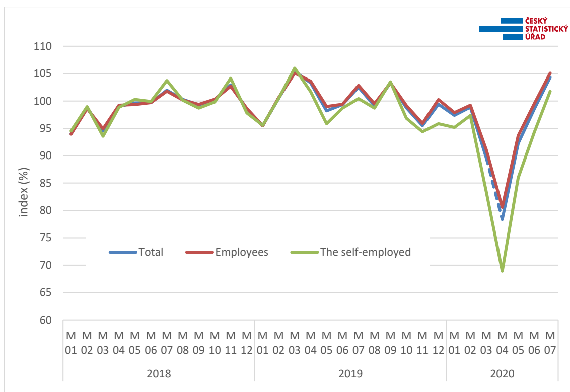
Chart 1: Hours actually worked for a week in main job from the LFSS, index to the corresponding period of the previous year

Data about hours worked by individual month drawing from the Labour Force Sample Survey (LFSS) were the most characteristic results describing progress of the coronavirus crisis. They have been specially prepared since March and published within the News Release of the CZSO called Rates of employment, unemployment and economic activity.